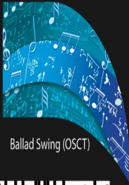
Ballad Swing (OSCT)