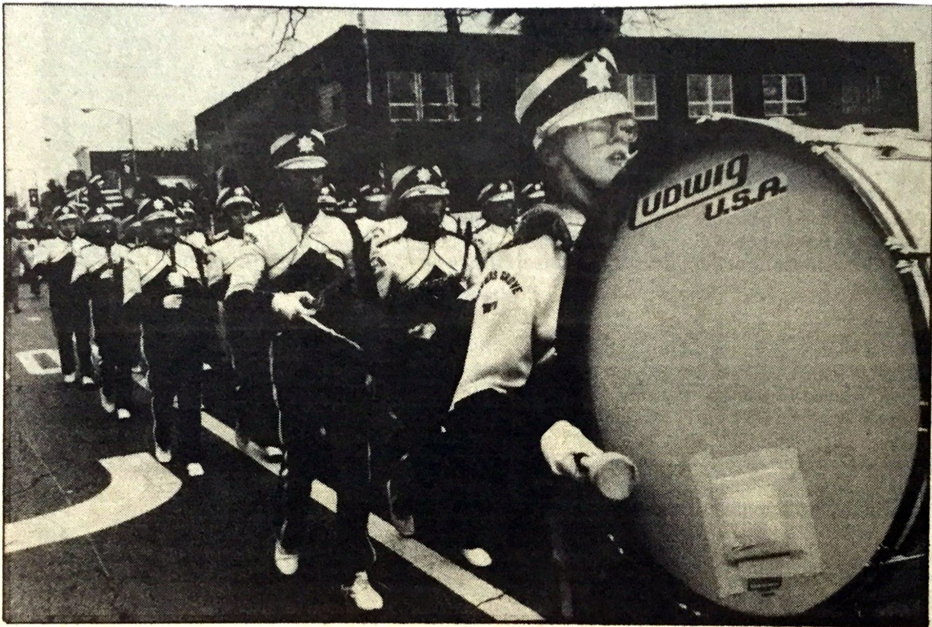
SIGHTS AND SOUNDS — The Downers Grove South Marching Band steps out along Main street to provide the sounds of the season during the Christmas parade.