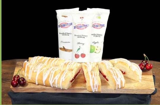
All-American Variety Pack

Butter Braids are braided pastries that come frozen. They are so easy to prepare. Just take them out of the freezer, let them rise overnight, and pop them in the oven for a delicious treat. This year there are 2 Variety Pack options as well as 5 tasty Individual Pastries to choose from.