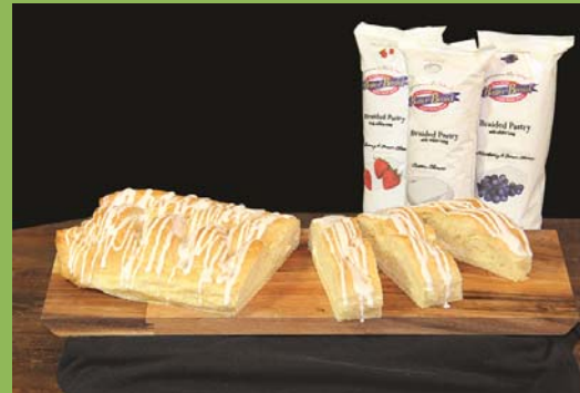
Cream Cheese Collection Variety Pack