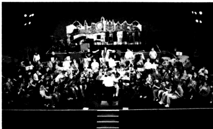
Rehearsal in London