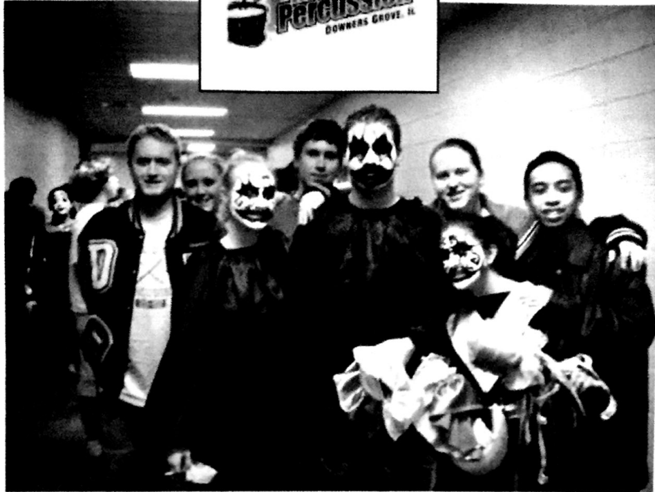
2004 Indoor Percussion